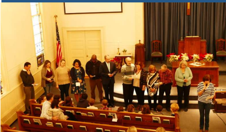
St. Thomas Mission Commissioning