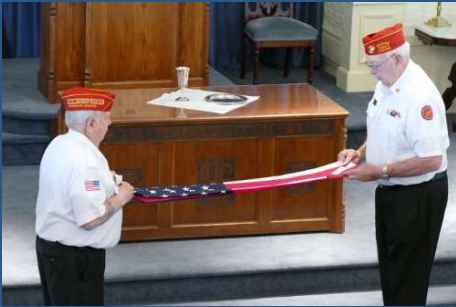
Memorial Day Flag Ceremony