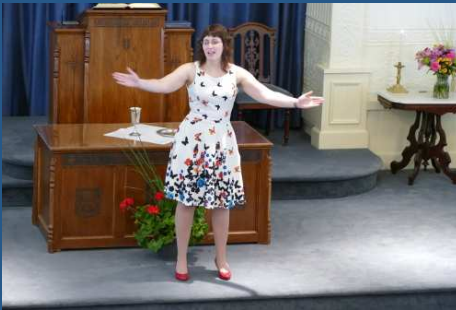
Signing to Praise the Lord