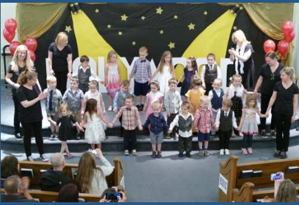
Three Bridges Christian Nursey School End of the Year Program